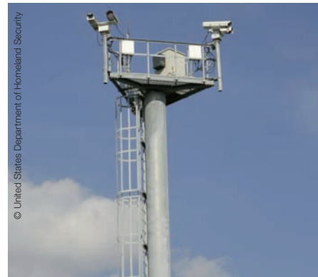
High tech equipment atop this pole is used to see and hear illegal immigrants attempting to cross into the U.S.

Numerous governments are seeking to step up security cooperation concerning border issues, whether it be fighting illicit immigration, narcotics traffic and organized crime as well as terrorism (the Spanish