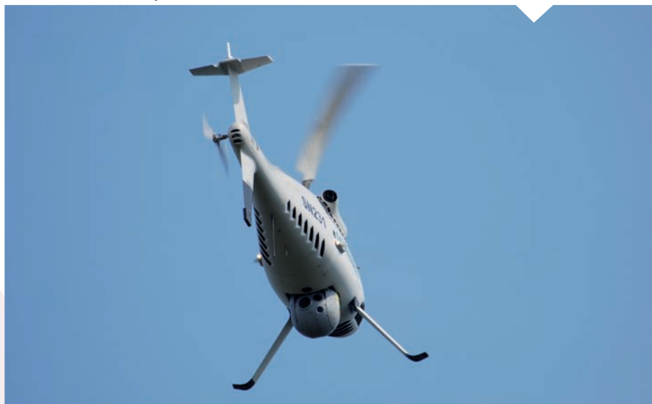
A Schiebel Camcopter-S100 Unmanned Aerial Vehicle (UAV), equipped with Thales Electro-Optic/Infra-Red Agile II turret, watching the border of an African country.

enclave of Melilla between Spain and Morocco; the growth of radical movements like Al Qaeda in Islamic Maghreb (AQIM) in the barren Sahel region, including in Senegal, Mauritania, Mali, Niger and Algeria; development of an «African road» for cocaine that profits from open borders in the Sahel). Interpol estimates that about 50 tons of cocaine with a street value of USD 1.8 billion circulate each year in West Africa 2 . The European Union's FRONTEX agency is a model in this field with, among other things, the EU-financed land border surveillance system (TALOS) program. A consortium consisting of 10 countries has devoted EUR 20 million to develop a surveillance system made up of robots, unmanned aerial vehicles (UAVs) and mobile command posts perfectly adapted to open borders whose control and surveillance can't easily be ensured by conventional means. ■